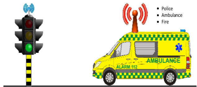
Fig.2 Priority Based Signaling in an Emergency Vehicle Ambulance

The most complex and risky scenario on road is to providing special way for ambulance in critical condition. Near about every time ambulance driver put many lives in risk to save single person life. For that we need to build a special authority based system where ambulance driver can control the signal activity for an instance of time. So the proposed system is developing to provide transmitter and receiver based signal controlling for particular time. We will use acouple of transmitter and receiver using which ambulance driver can control the signal for particular time and can reset or restart the signal working. On other hand to stop misuse of this system we will automatically generate the report for each time signal controlled by any ambulance. Where ambulance driver need to give details papers as a proof for controlling the signals.[7]